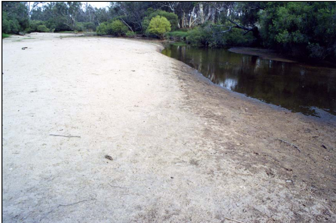
Sediment slug in a river pool, Avon River catchment

For this study, risk is assessed on the basis of average annual increases in sediment volume within the pools. The sensitivity analysis, presented in Section 5, considers this range of annual sediment increment to be from 0.5% through to 5% of the 1996 pool sediment volume. The higher value is used in order to account for massive sediment mobilization that may occur in a 1-in-10 year flood event (i.e. 50% of the existing pool sediment volume is added at some time within the 10 year period).