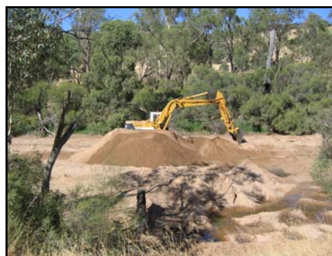
Excavation of coarse sediment from Long Pool February 2005