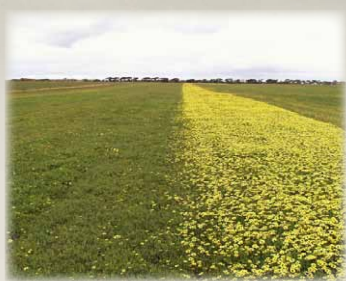
Autumn Cleaning in action, with the SantoriniA dominant pasture (left) versus a non Autumn Cleaned cape weed pasture (right) dominant

"Similar ongoing costs are associated with growing serradella in rotation rather than the traditional legume lupins" says Rodney. These costs are grass selectives as well as glyphosate which is used in the autumn cleaning technique. "In regards to controlling other weeds we use a weed wiper in patches over the serradella paddocks and a broad leaf spray is used during establishment".