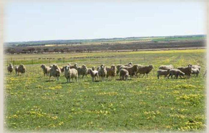
Sheep grazing Santorini

serradella, but were soon impressed with how it was performing. Since then they have increased by a paddock a year. Rodney states that "it was easy to establish with press wheels and tyne and that it was a lot harder in the early days with the combine but we got away with it due to the wet starts".