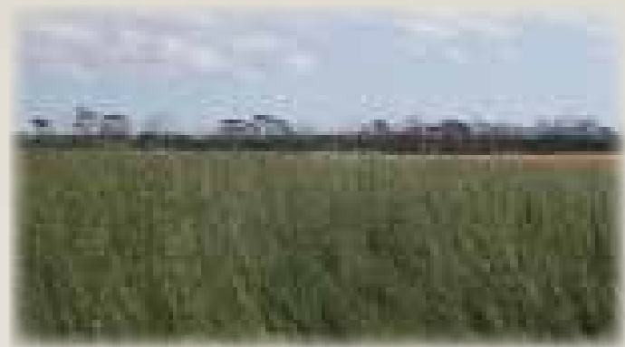
Geoff and Vivienne Marshall grew this high-yielding Saia oat cover crop in 2003. The residue provides excellent soil cover during summer and autumn, although the crop is mainly used to help suppress the problematic weed annual ryegrass.

In adopting low-disturbance farming, the Marshalls have made every effort to develop a system that protects their soils against topsoil loss when the occasional windstorm occurs. During late May 2009, after 100 km/h winds moved across the Hyden district, Geoffrey noted most of his farm did not suffer any erosion. 'My wife was driving to Hyden at the peak of the windstorm and she had to stop because she couldn't see through the dust that had been picked up from other farmers' properties where high-residue, low-disturbance farming is not used,' he said.