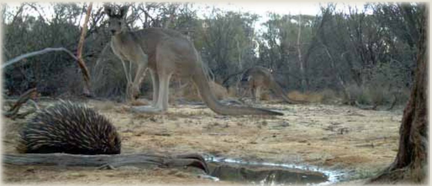
Stand off at the waterhole - A Kangaroo and Echidna caught by Phil Lewis, WWF on camera trap