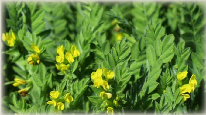
Yellow Serradella flowers

SantoriniA yellow serradella is a very deep-rooted, acid-tolerant and hardseeded species highly suitable for infertile acid deep sands. SantoriniA was released in 1995 and is suited to areas of medium rainfall (350-450mm). SantoriniA can be used in pasture/crop rotations on sandy soils and in long-term pastures on the poorest acid sandplain soils. It is important that the year after establishment of Santorini the paddock is cropped. SantoriniA has some tolerance to subsoil aluminium.