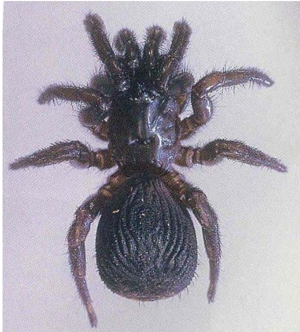
Shield-backed Trapdoor Spider.