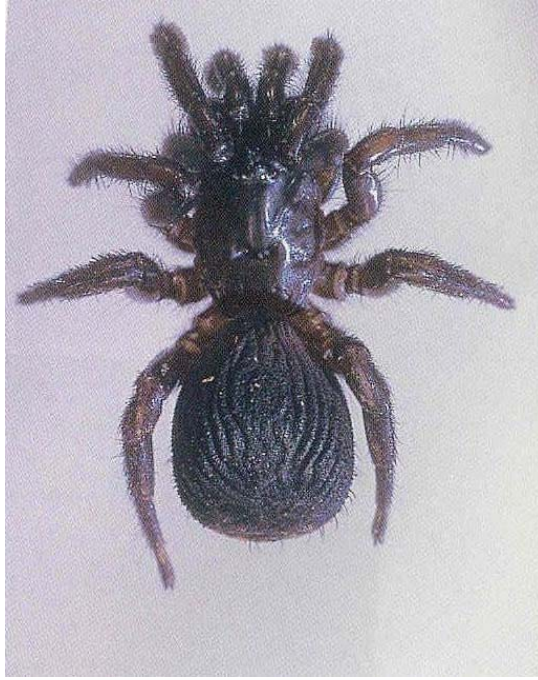
Figure 1: Photograph of I. nigrum .