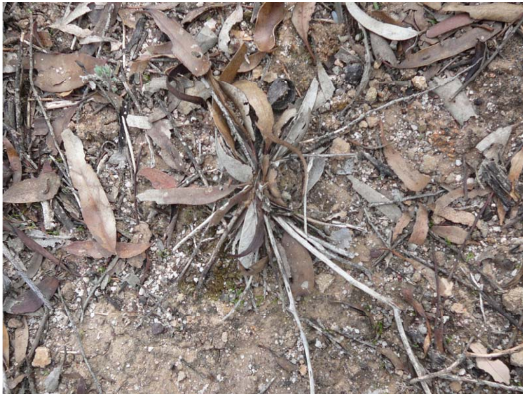
Figure 3. Typical burrow of Shield - backed Trapdoor Spider

I. nigrum dig tubular burrows that are about 20-30cm in depth and are lined with silk (Main, 1992). These burrows are wider at the base and opening than in the centre, and the entrance chamber is cup-like. These spiders attach twigs, leaves and debris to the rim of the burrow typically, but not exclusively in a moustache configuration (See Figure 3). These twig lines act as sensory lines to assist with foraging (Main, 1952).